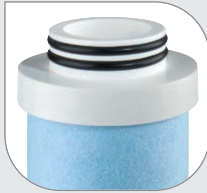
BX Quick-fit configuration with 45 mm double o-ring collar. Fit to Plus 3P BX housings, DP housings, K DP housings, Depural® Top, Bravo DP, Oasis DP.